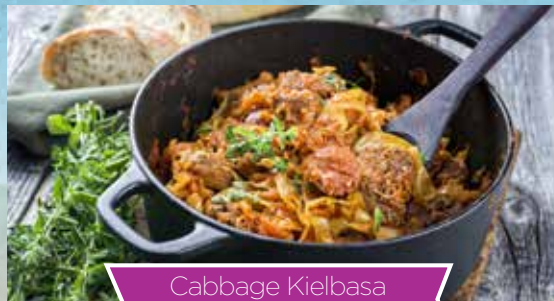
Cabbage Kielbasa Casserole