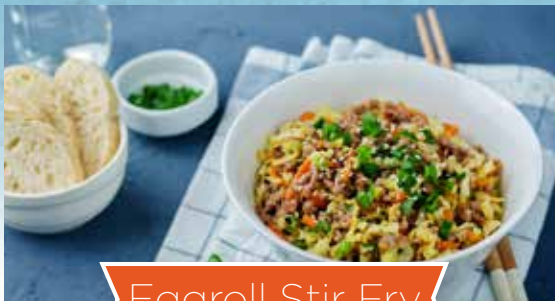
Eggroll Stir Fry