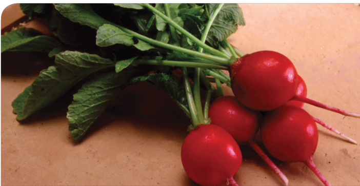
Bunch / Cello

French Breakfast features a cylindrical root, two to three inches in length. The root is 2/3 scarlet with a white tip. The mild flavor and early/mid maturity make this a favorite in its class.