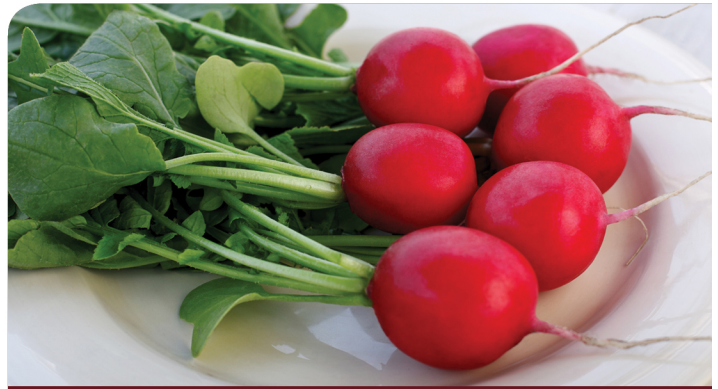
Cello / Bunch / Multi

Cherriette is a warm season radish used in the fall and spring in most areas. It has a bright red color and short tops. This variety is uniform and slow to develop pith. Cherriette performs well under warmer conditions and yields better than O.P.s in its class.