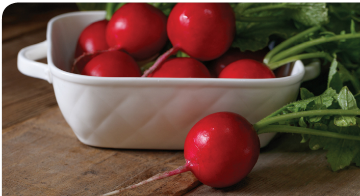
Cello / Bunch / Multi

Crunchy Delight is a summer type radish that displays very nice uniformity and internal qualities. It is tolerant to cracking and pithing. Medium-height erect tops connect to consistently round bulb shaped fruit with a glossy scarlet red exterior and brilliant white interior. Crunchy Delight displays excellent yield potential, especially in Northern growing areas.