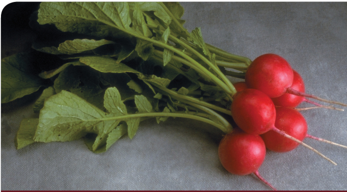
Bunch / Cello