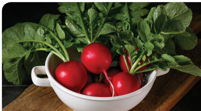
Cello / Bunch / Slicing

Our radish program offers an array of choices of cello, bunch, slicing and multi use varieties. All are bred with the grower in mind and offer excellent yields and high-quality. When it comes to radishes, Sakata delivers reliable performance and market versatility. That's the Sakata advantage!