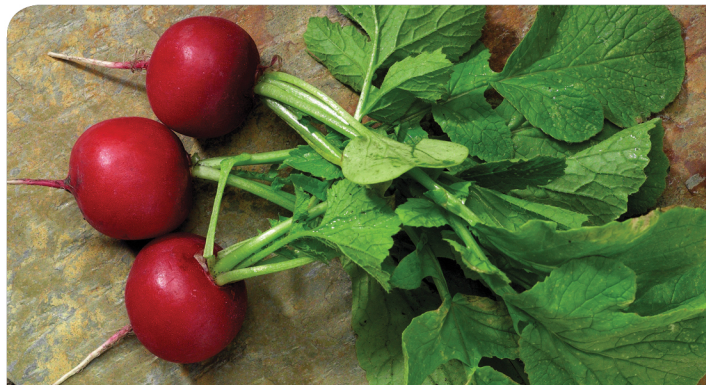
Bunch / Cello

Regal Red is a fast-maturing summer radish variety that produces uniform, round bulbs. It is a consistent performer in many regions of summer radish growing areas, as well as spring/fall seasons of winter radish growing areas, and has a medium-short top.