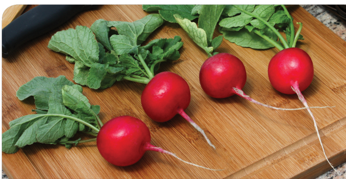
Cello / Bunch

Crunchy Royale is a dark red, round radish ideal for bunching or cello pack. It yields high quality and extremely uniform roots. Overall, Crunchy Royale offers excellent internal and external color and a high pack-out rate for growers.