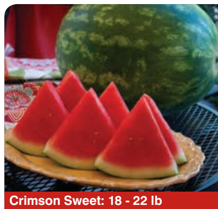
Crimson Sweet: 18 - 22 lb

Early maturity coupled with firm, crisp flesh make this watermelon an easy choice for growers. Charismatic features strong, vigorous vines and has excellent yield potential. For optimum results, use a Sakata early pollinizer.