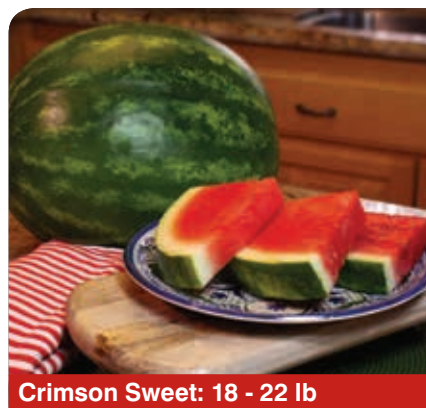
Crimson Sweet: 18 - 22 lb

Secretariat is an early-maturing variety that is very high yielding. It offers a smooth, medium-green exterior with green stripes and has a nice round-oval shape. Interior characteristics include tiny pips and firm, crisp, deep red flesh. For optimum results, use a Sakata early pollinizer.