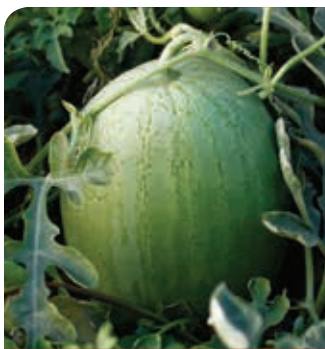
Ace Plus Pollenizer