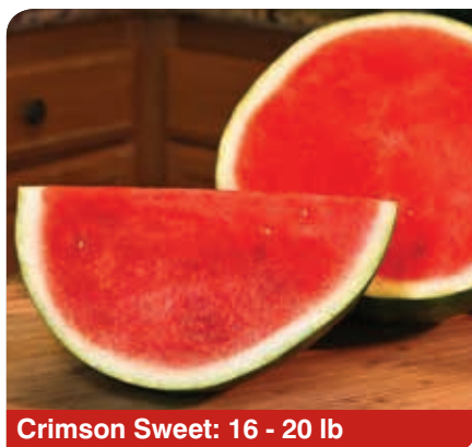
Crimson Sweet: 16 - 20 lb