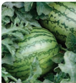
Wild Card Plus Pollenizer