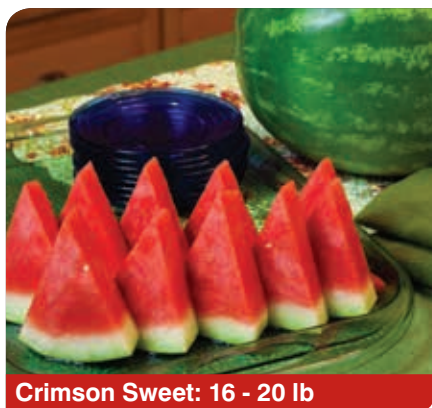
Crimson Sweet: 16 - 20 lb

Kingman is a 36/45-count watermelon that offers firm, crisp flesh and tiny pips. Plus, it has strong vines and has high yield potential. Bright red, tasty flesh makes this a melon great for eating.