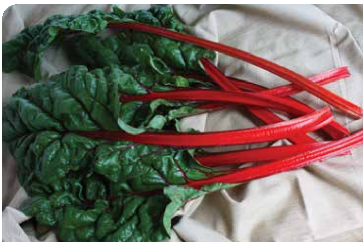
Baby Leaf / Mature