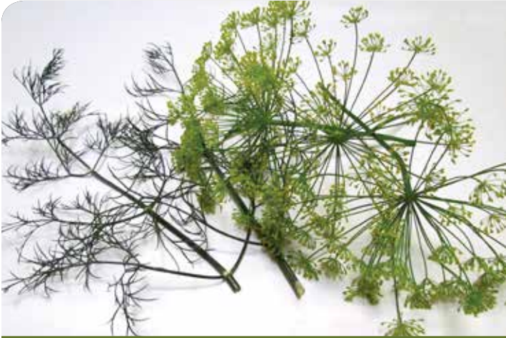
Dill / Herbs