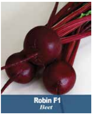
Robin Mature/Baby Leaf

Robin is a perfect variety for whole baby beet production due to its ability to form a uniform globe shape root at an early stage in development. It has a medium to late growth rate and it is a very versatile variety that can fit into multi markets such as processing to fresh markets. Robin has nice dark red interior and exterior which makes it an appealing variety for any grower.