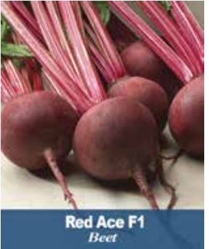
Red Ace Mature/Baby Leaf

Red Ace's wide adaptability and high yield potential have made it an industry leader. Red Ace is known for its uniform, smooth top-shaped roots, heavy yields and consistent performance. Organic and non-organic seeds are available.