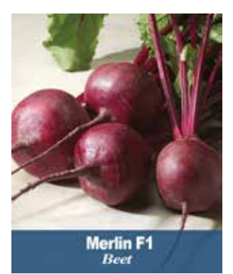
Merlin Mature/Baby Leaf

Merlin offers higher sugar content (12-15%) in comparison to standard beet varieties. Due to its high sugar content, it is a perfect choice for processors, fresh market growers or home gardeners. Merlin has smooth, red, globe-shaped roots with small-medium crowns and tap roots. Merlin also offers intermediate Cercospora resistance. Organic and non-organic seeds are available.